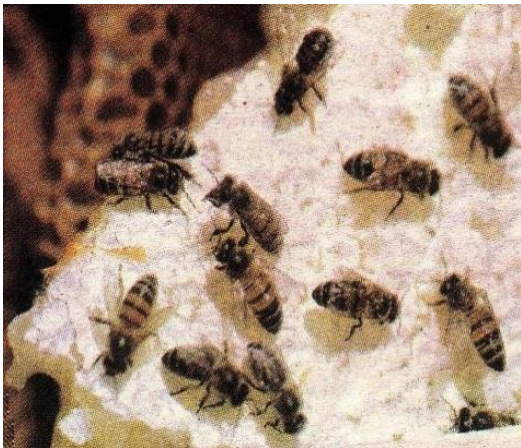
Bees are a deadly horror when they all swarm!

How would you like one of those jumping on your FACE?