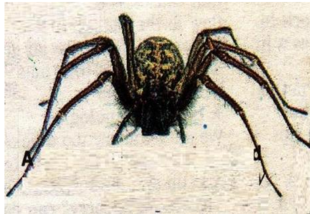
A phobia of spiders is called arachnophobia